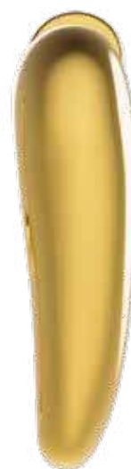
C08211 DK 35x145